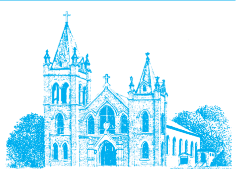
St. Gabriel Archangel

St. John's - 8:15 am St. Gabriel's - 12:10 pm St. Gabriel's - 6:00 pm